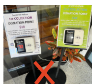
No longer operating (from August)

From the month of August, one set of our tap and go machines will be discontinued, meaning donations cannot be made through them. However, the set of machines on the stands in the church foyer will remain functioning. Please make your donations to the first or second collection using these machines.